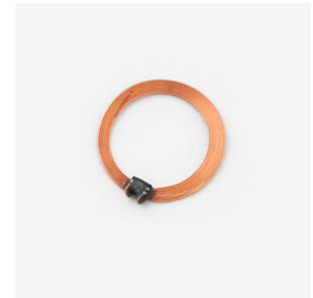
12/10/8 mm Dia Coils