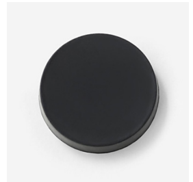
30/20/15/12/10/7/5 mm Epoxy Tag