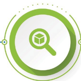
Asset Management & Tracking