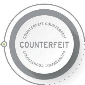
Authenticity and Counterfeiting