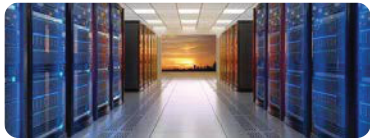
IT Asset Tracking